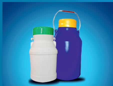
VETINARY (Animal Feed) Products

You may contact us in whatever way convenient to you. We are available 24/7 via email or telephone. You can also visit our office personally. Alternatively you may email us with any questions or inquiries or use our contact data. We would be happy to hear from you.