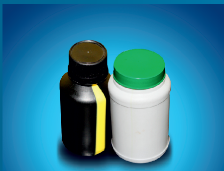
BOTTLES (Liquid Packaging) 900ml to 100ml