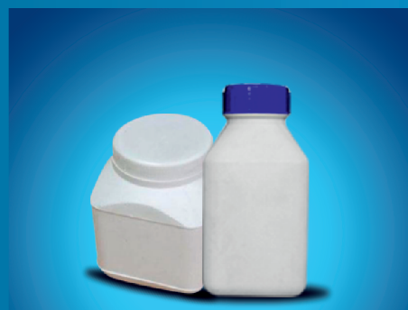
RANGE OF JARS (Powder and Paste Packaging)