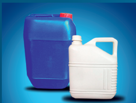
JERRY CANES (Liquid Packaging) 20 Ltr to 10 Ltr

We have a complete range of HDPE bottles, jars and jerrycanes ranging from 100 ml to 20 ltrs. Our products are food grade, corrosion free, odour less and non-toxic. They are safe for use with all forms of industrial and hazardous chemicals, solvents, powders, gels etc. Our products conform to ISO standards and export requirements of different countries.