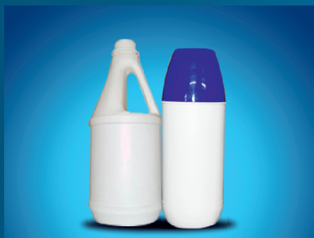
BOTTLES (Liquid Packaging) 1Ltr range